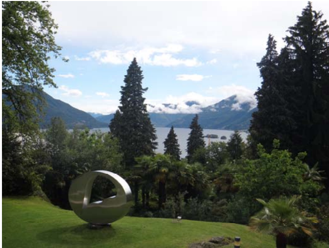
A view from the conference site on Lago Maggiore and gladly, this expectation proved to be right.

Monte Verità – or the “Mountain of Truth” – is the name of a hill in Ascona overlooking Lake Maggiore chosen at the beginning of the 20 th century by a cosmopolitan group of idealists and artists experimenting with different forms of alternative world views and life styles. Today, the hill is the site of a hotel complex and conference centre. Against this special historical background, Monte Verità appeared to be a good place to think about the future of the Security Council, and the international legal order in general –